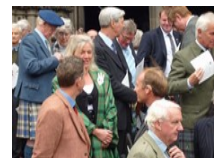
A gathering of Clan Chiefs at the Battle of Flodden Celebration