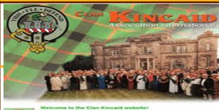
Picture of the 2003 Clan Kincaid Gathering at The Kincaid House Hotel

We are pleased to report that the Core Tour for the “ Clan Kincaid Gathering – 2014 ” has been fully subscribed so we have a full coach for this part of our Gathering. The Extended Tour still has a number of places available.