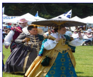
Mary, Queen of Scots and her Court