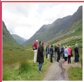
Clan Kincaid in the Glen Coe

had a box lunch today and then proceeded to visit Inver-Inveraray Castle invaded by Kincaids