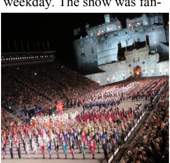
The Tattoo finale with all the performers assembled and playing together

performance. By sheer luck this performance was being taped by the BBC so we had the extra surprise of fireworks not normally provided on a weekday. The show was fan-