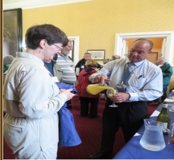
cial, Dunfermline City Chambers