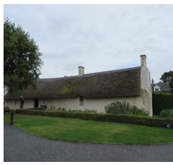
The Burns Cottage

and Tam O'Shanter Experience Regrettably, we did not have time for people to go to the Brig