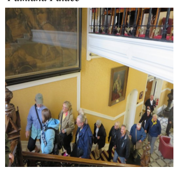
Kincaids proceed up the City Chambers, Dunfermline