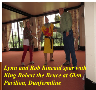
August 13th – Wednesday

The two groups assembled again in Pittencrieff Park for a dinner provided by Dunfermline. The expected entertainment of