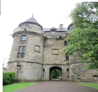
Entrance to Falkland Palace

Raining this morning as we departed after breakfast for Scone Palace in Perth. We had an introductory presentation followed by freedom to roam the palace and grounds. Lunch was at the Loch Leven larder (another quiz). Then we traveled to Falkland Palace.