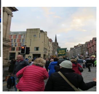
Clan Kincaid banner is easily seen in the Fringe Festival and Tattoo crowd

The group re-assembled at St. Giles Church and we then proceeded to march as a Clan to the Royal Edinburgh Tattoo