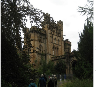
Clan Kincaid members at Lennox Castle