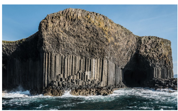
Fingal's Cave—Isle of Staff Scotland

Now there are scientists who will say the beginning and end of the Giant's Causeway are nothing more than the cooled crystals of basalt from some ancient volcanic eruption. But that is nonsense. Now you know the real story. Those who have visited the Antrim Coast of Ireland will attest to the fine con-